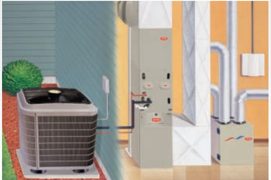
Heat Pump and Fan Coil System

Some models offer DuraCoat™, a special tin plating of the coil to reduce the threat of formicary coil corrosion.