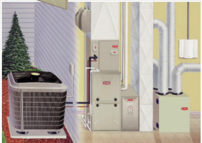
HYBRID HEAT® Deluxe Heat Pump and Deluxe Gas Furnace System