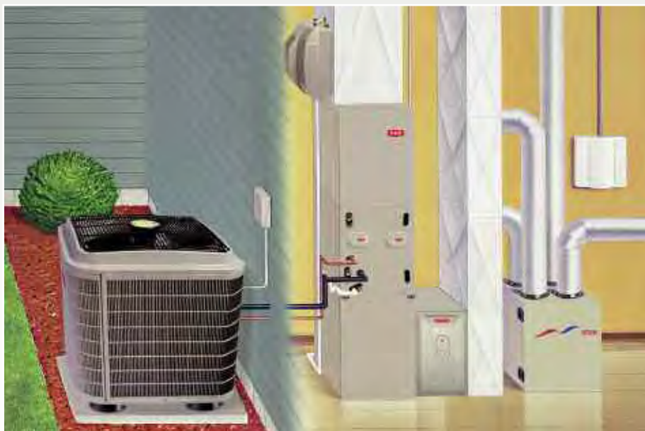
Heat Pump and Fan Coil System