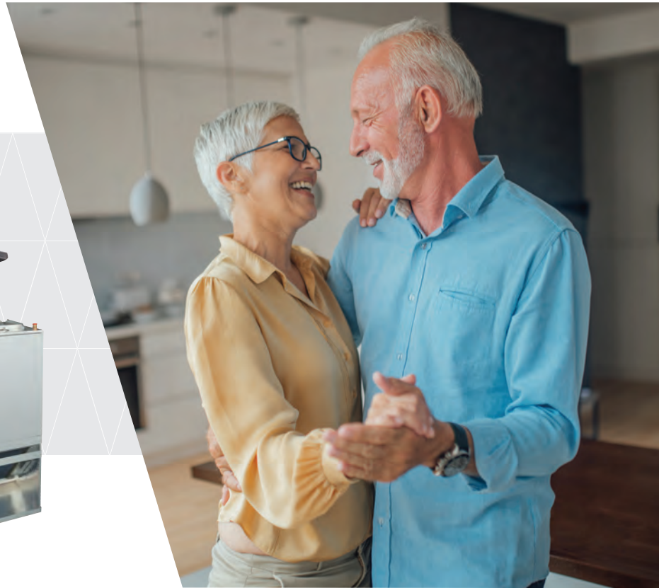
Models FE4, FE5, FV4, FZ4, FJ4, FMC, FMU, FMA