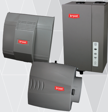
Models STM, LBP, SBP, WBP, LFP