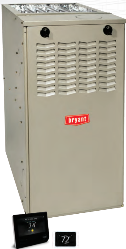
Control and Smart Sensor sold separately