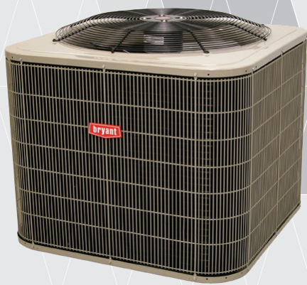
Models 115S, 114S