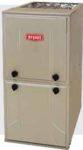
Model 926T and 926S